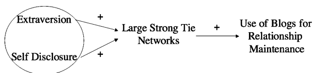
Figure 1 Model of proposed relationships

The most frequently measured aspect of relationships is tie strength, or intensity, an indication of how close a respondent reports being to each network member (McCarty, 1996). Strong tie contacts are characterized by frequent, reciprocal communication and usually a long, stable history of interaction. Often, strong ties constitute relationships with family and close friends. In contrast, weak ties are characterized by infrequent communication, low reciprocity, and a lack of emotional